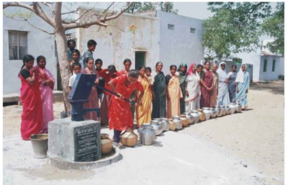
Getting their fill

Recognizing the vital importance of safe water, Rotary International's policy encourages all Rotary districts and clubs to support efforts which help people to gain access to safe water. The safe water projects are to be reasonably close to homes using simple sustainable technology. This policy is reflected in projects of all sizes in all parts of the world.